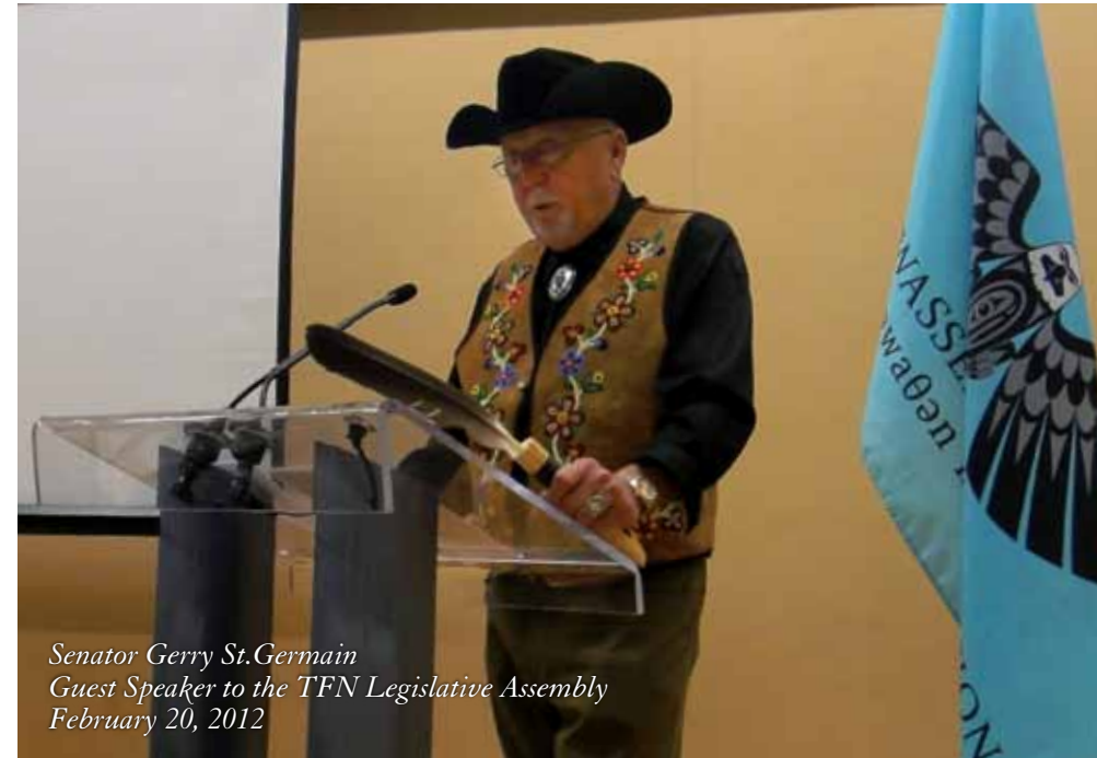
Senator Gerry St. Germain Guest Speaker to the TFN Legislative Assembly February 20, 2012