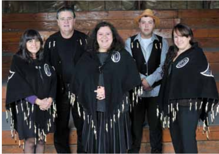
The following are some decisions from Executive Council that the Community may find interesting from meetings that took place from December 2011 to June 2012.